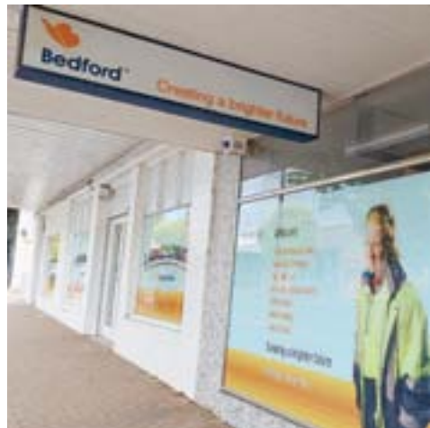
Bedford closed the laundry late last year.