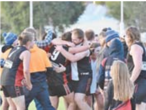
Nangwarry players embrace the moment.