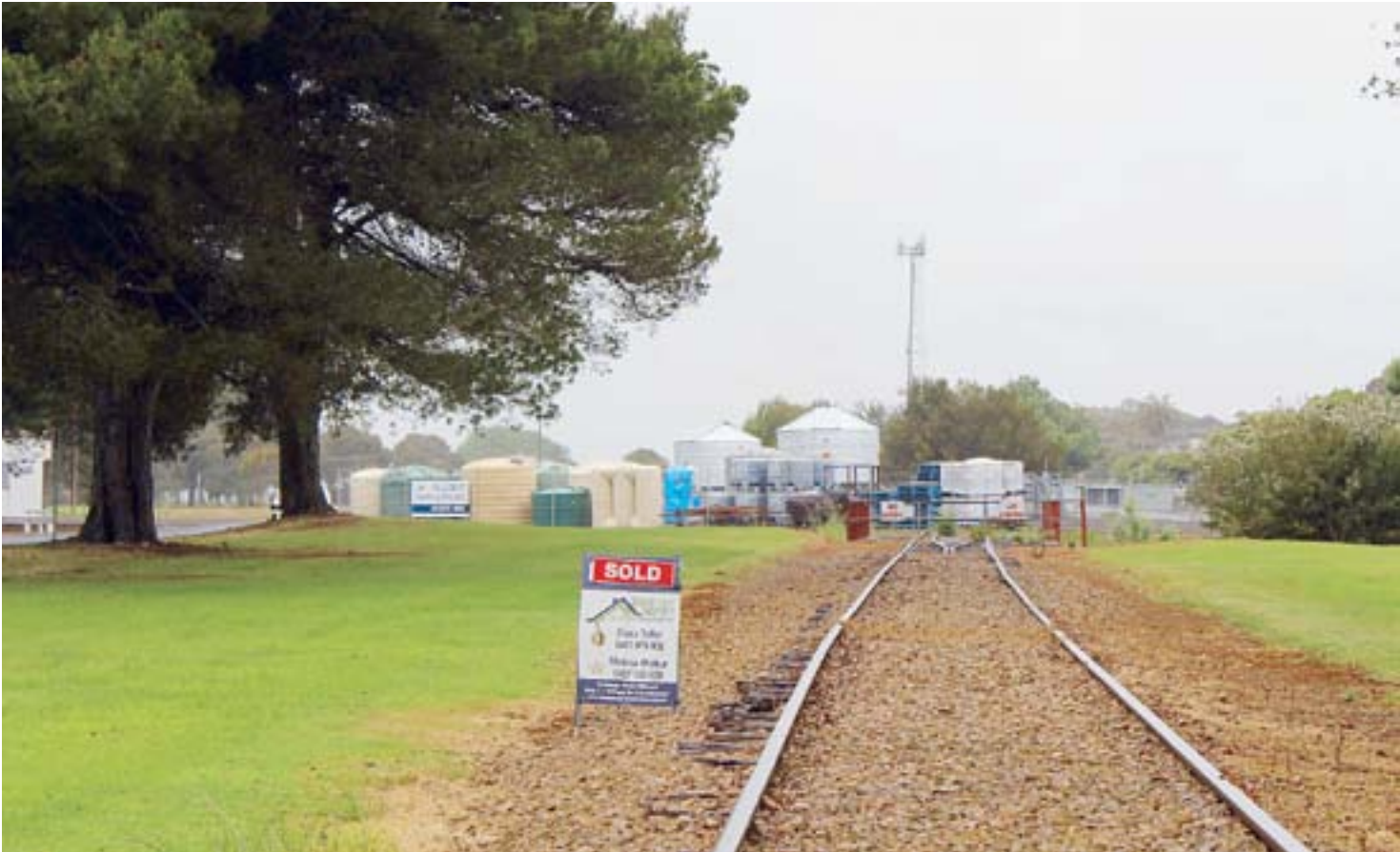
Approval has been received for the new unmanned service station adjacent to Apex Park.