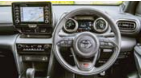
The new GR Sport can be immediately identified by its revamped interior.