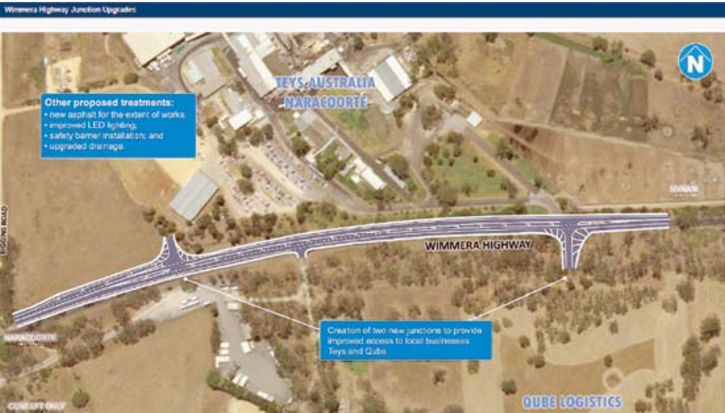
Highway Upgrades: There will reduced speeds along the Wimmera Highway in Hynam as roadworks are undertaken in the next six months.