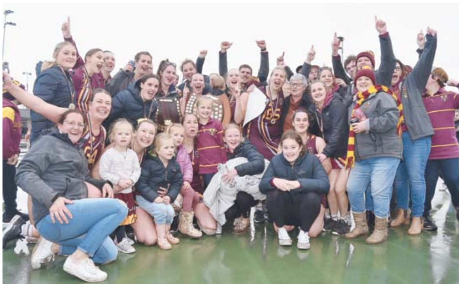
Glencoe's A Grade netballers were joined on court by supporters after a drought-breaking Mid South East premiership victory over Kalangadoo.

When the final whistle blew the Glencoe faithful joined the players on court, with some emotional scenes to follow.