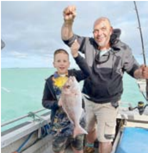
Extreme Marine Charters put these clients onto a nice snapper.

numbers from the carpark all the way down to the mouth.