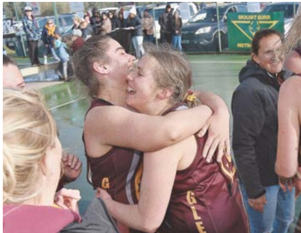
Smiles were hard to hide, even through the tears of a grand final victory for Glencoe A Grade netballers.