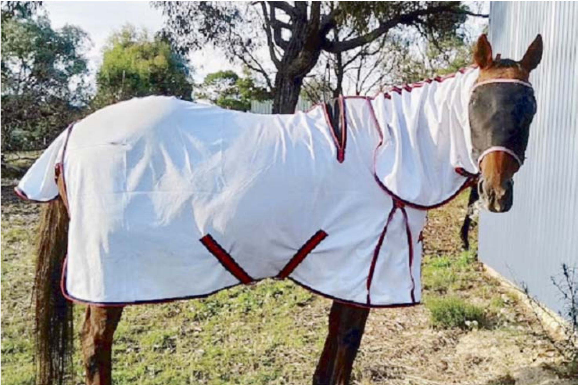
Protect yourself and your animals from mosquito bites to avoid contracting Japanese Encephalitis.