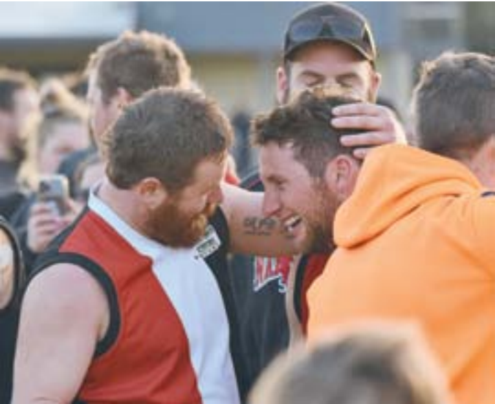
Nangwarry players are overwhelmed by their victory.