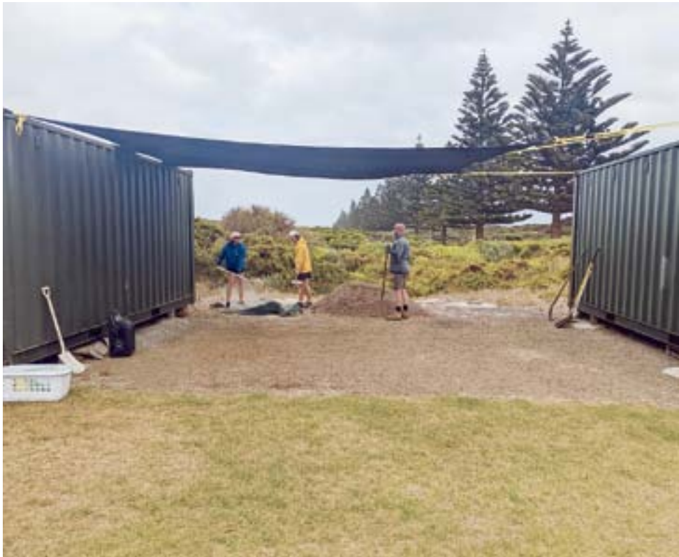
The site before the third shipping container had been placed and roofing added.