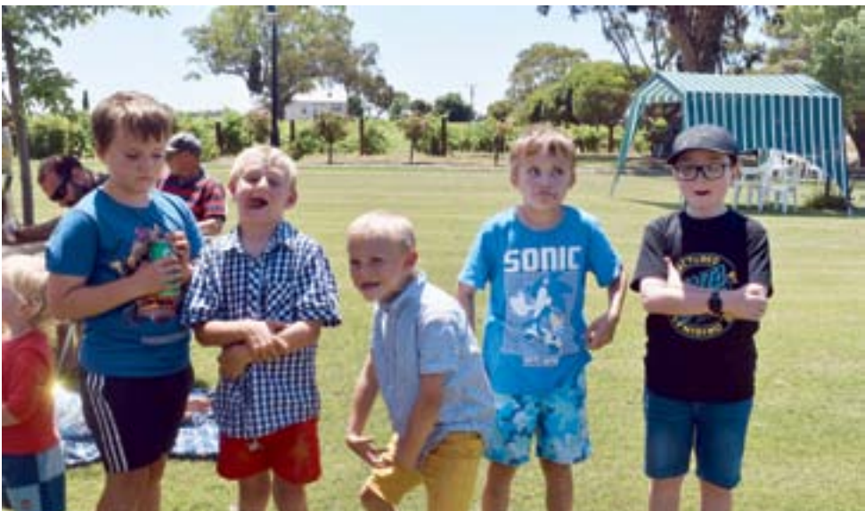
Even the kids got in the act to celebrate New Years Eve.