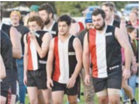
Nangwarry players walk off the ground, pleased with their efforts.