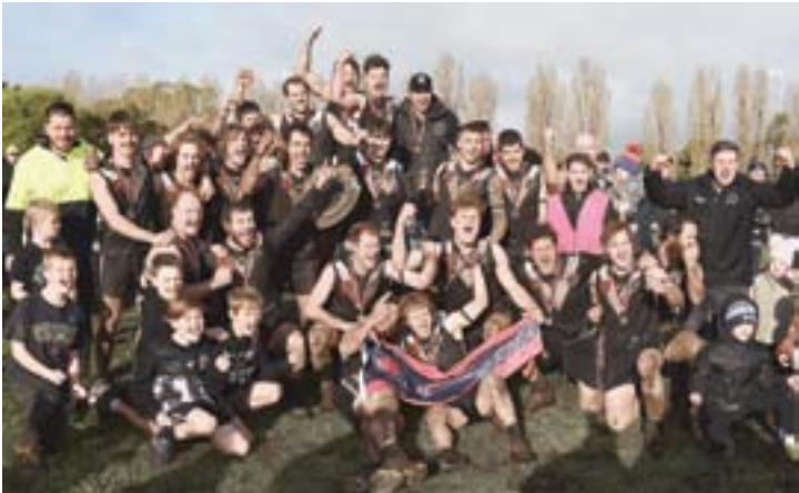
Premiers: Kalangadoo celebrated after a tough slog on grand final day.

too much, with a big crowd in attendance, with umbrellas and rain coats the fashion of the day.