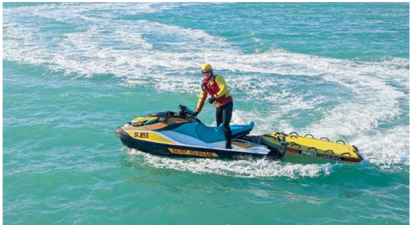
Beachport Surf Life Saving Club is now home to a jet ski that will be on hand to assist during the jetty swim.