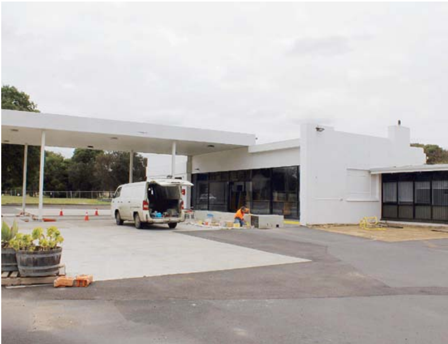
The Mount Burr Road service station is not expected to open for two months due to delays.