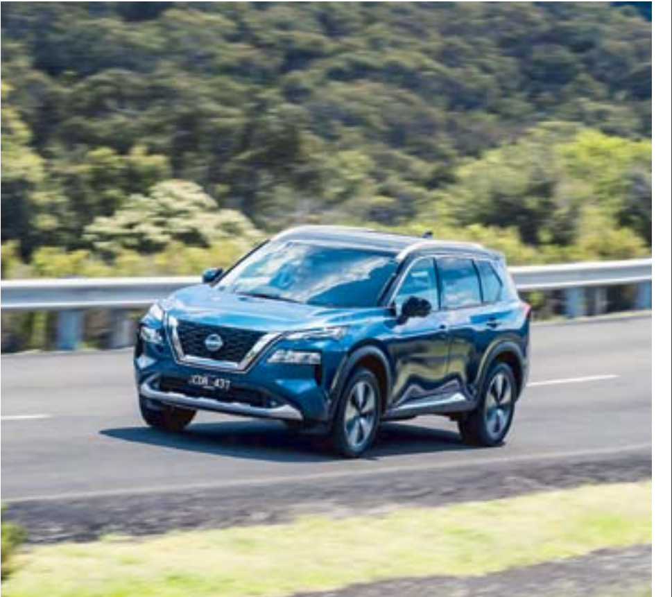
The latest Nissan X-Trail gets extra safety and a power boost.

New X-Trail is priced from $40,424 driveaway for the two-wheel drive ST up to $57,340 for the top-of-the-line Ti-L.