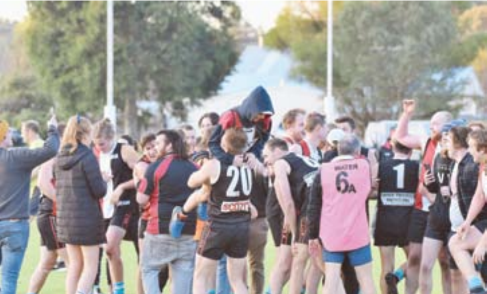
Nangwarry players and supporters come together after the Saints first win since 2014.