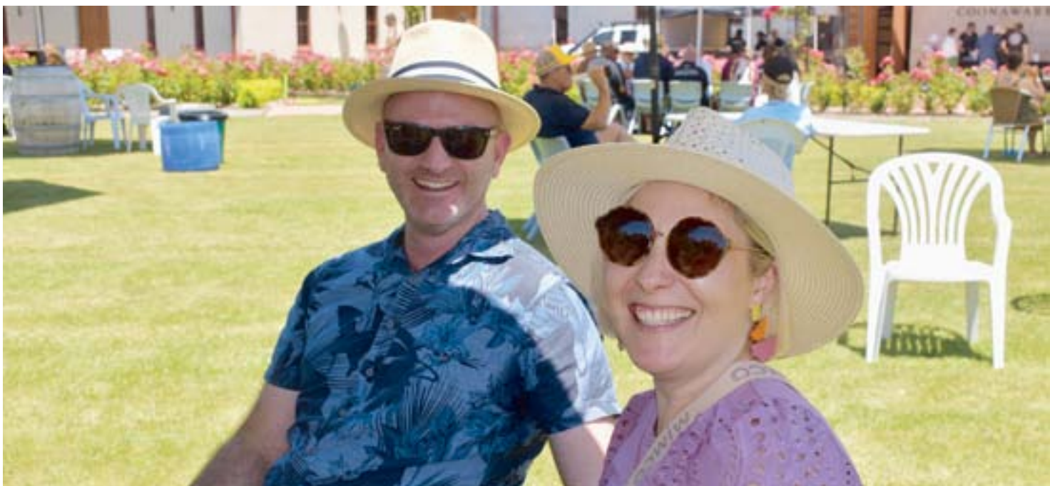
Visitors to Penola enjoying New Years Eve at Leconfield.