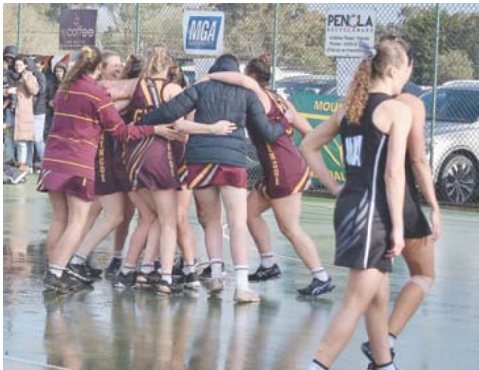
Glencoe A Grade netballers celebrate after the final MSEN A grand final whistle, while Kalangadoo players head despondently back to the bench.