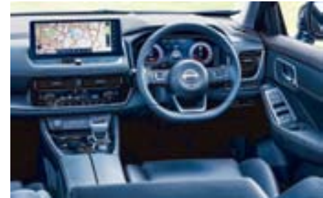
The new X-Trail will be available in the choice of either a five-seat or seven-seat variant.

An all-LED slimline lighting package front and rear, with bright multi-reflector LEDs for high and low beam driving and wraparound boomerang-shaped tail lights, complements