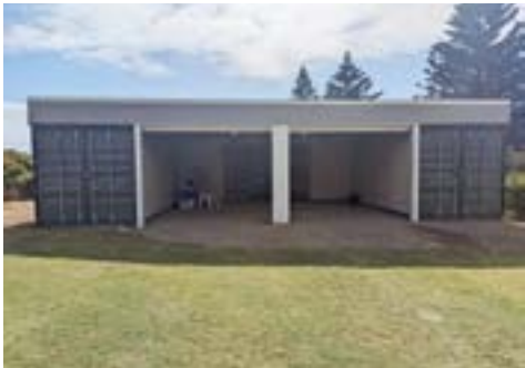
The clubrooms have recently undergone extensive changes to create a more usable space.

recently established club and encourage primary school aged children to learn about water safety.