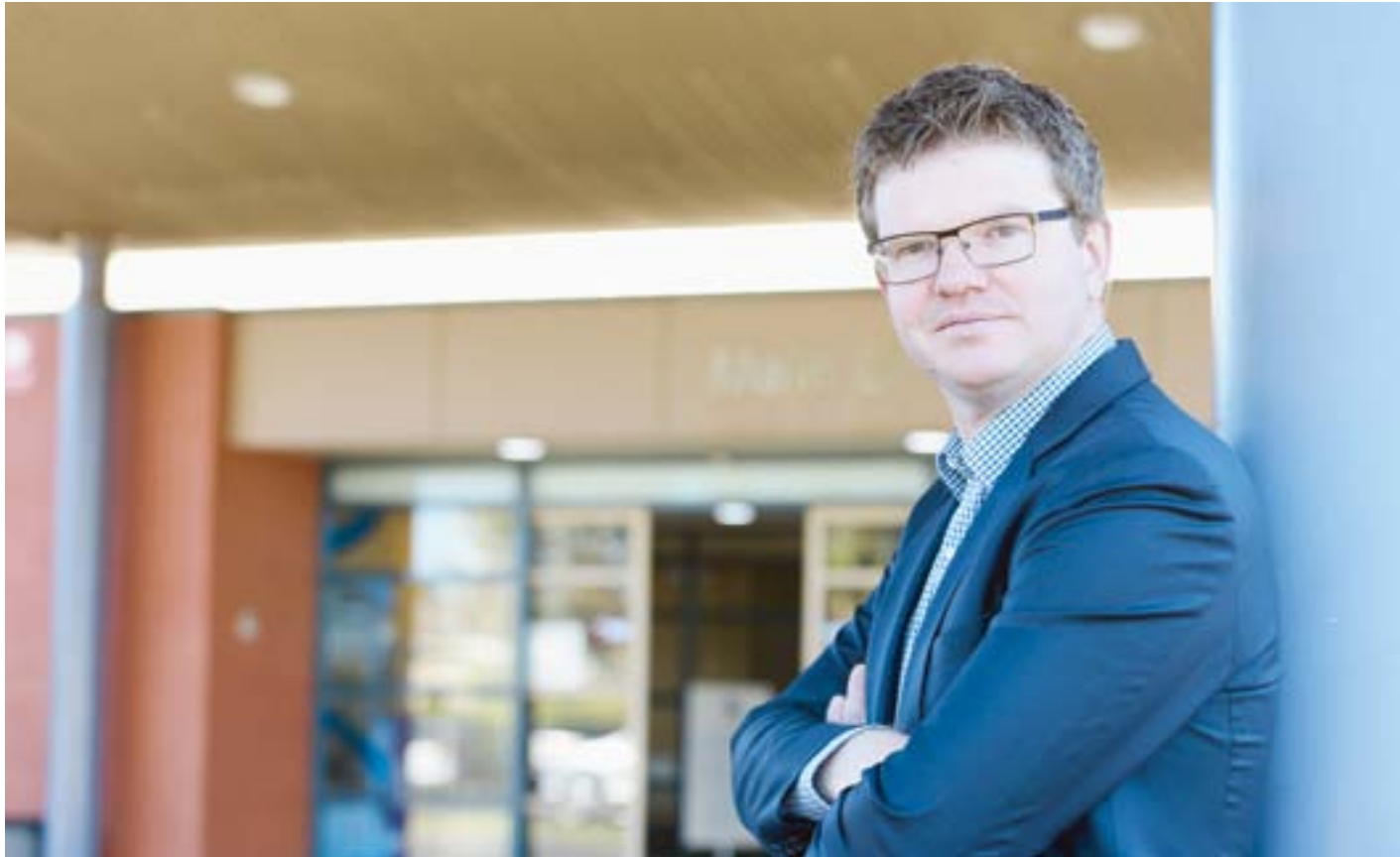
Subsidy: Minister for Health and Wellbeing Chris Picton.

“This increase will give a helping hand to more people needing to travel to vital medical appointments,” Dr Meyer said. “With the rising costs of living and increasing fuel costs, we know how important this subsidy is to people living in regional and remote communities.” The State Government encouraged people living in regional areas to check their eligibility and apply for subsidies on the PATS website if they needed help with transport costs for medical appointments.