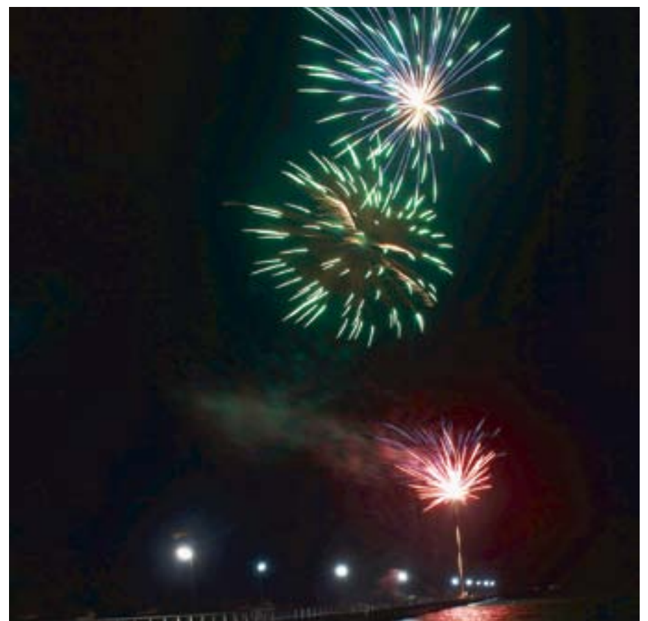
Fireworks lit up the sky from the Beachport jetty delighting locals and tourists.