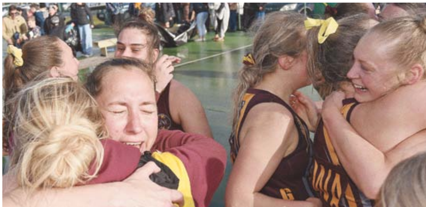
Emotions flowed over as Glencoe claimed the MSEN A Grade netball premiership.