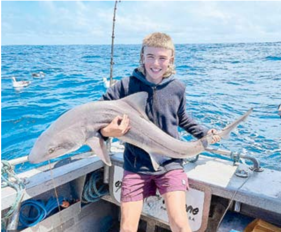
This client of Extreme Marine Charters was all smiles with his shark.

Whiting numbers have been excellent and we have seen plenty from right across the