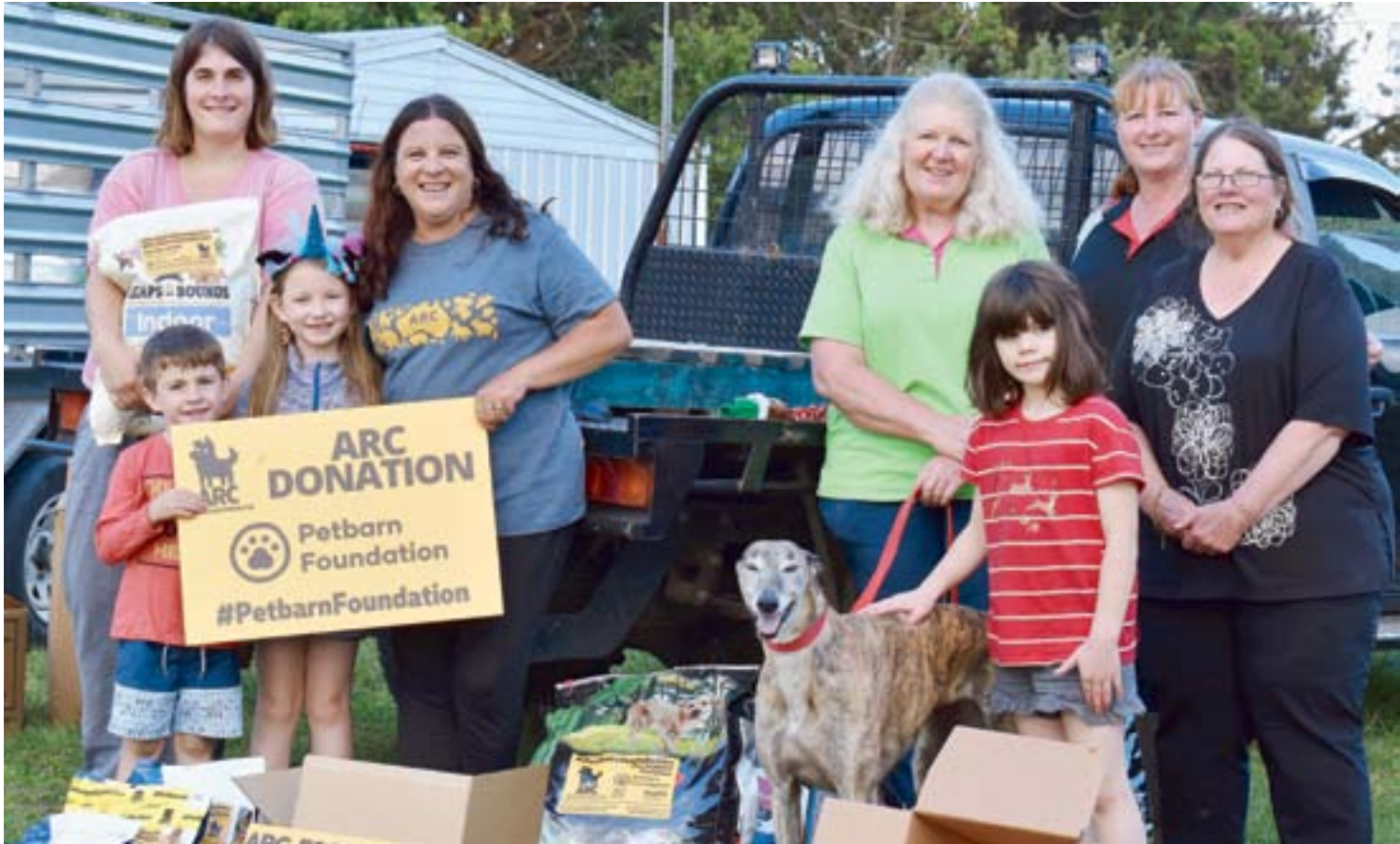
GIVEAWAY: Animal Rescue Cooperative held a pet food giveaway for Glencoe and the surrounding communities.