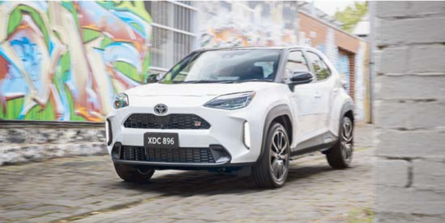
New Toyota Yaris Cross gets styling changes but no extra performance.

Unique 18-inch alloy wheels with a twin-five-spoke design and bright machined finish also help to differentiate GR Sport from the rest of the Yaris Cross range, housing sporty