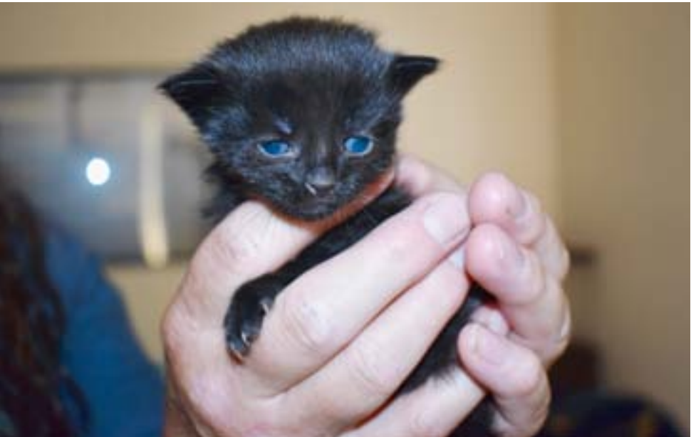
This little bubba at his litter mates, who are two weeks old, are in the care of Cats and Kittens Rescue.