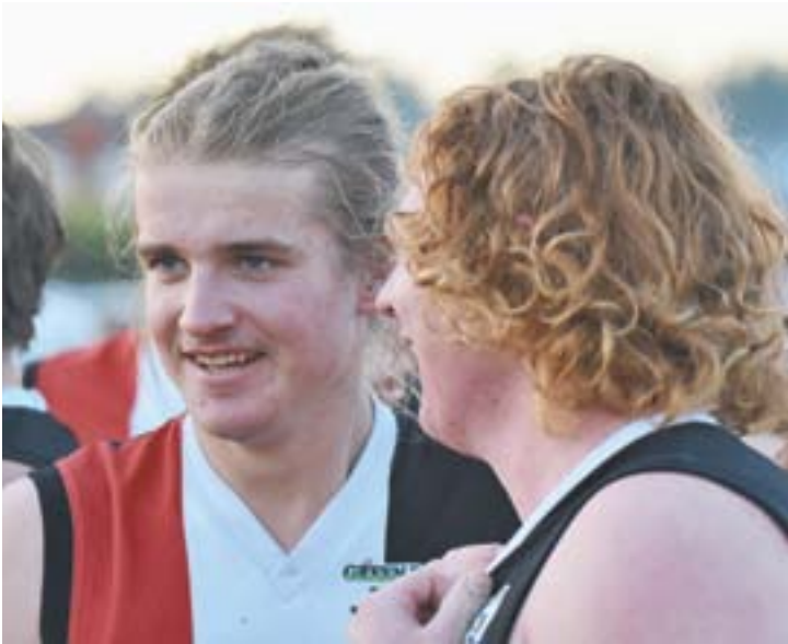
Nangwarry players share the moment.