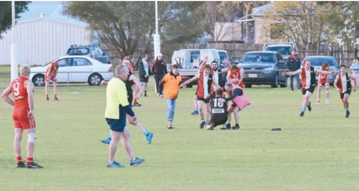
Nangwarry players celebrate while Tantanoola players stand with hands on hips after the Saints won their first Mid South East football game since 2014.

The achievement certainly made the 2022 season one not to be forgotten.