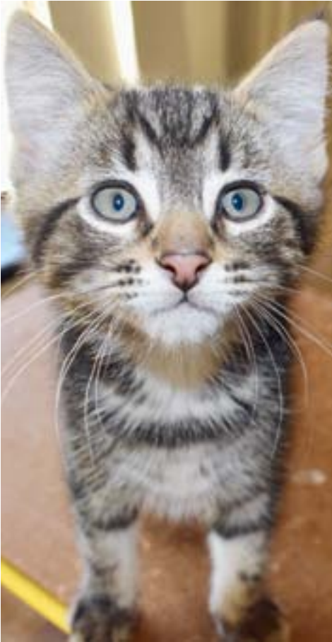
This kitten was having a great time on the cat tree.