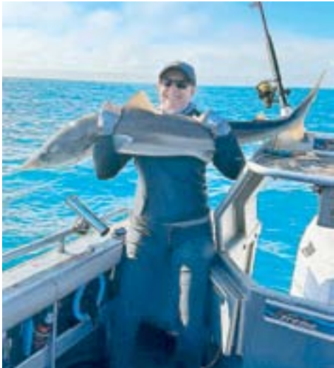
Want To Fish charters were also in on the act, putting their clients onto some nice shark.

There have been plenty of anglers walking the sand flats of the estuary this week, flicking soft plastics for bream and finding some good