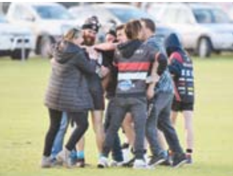
Nangwarry players are swamped by supporters after their drought-breaking victory.