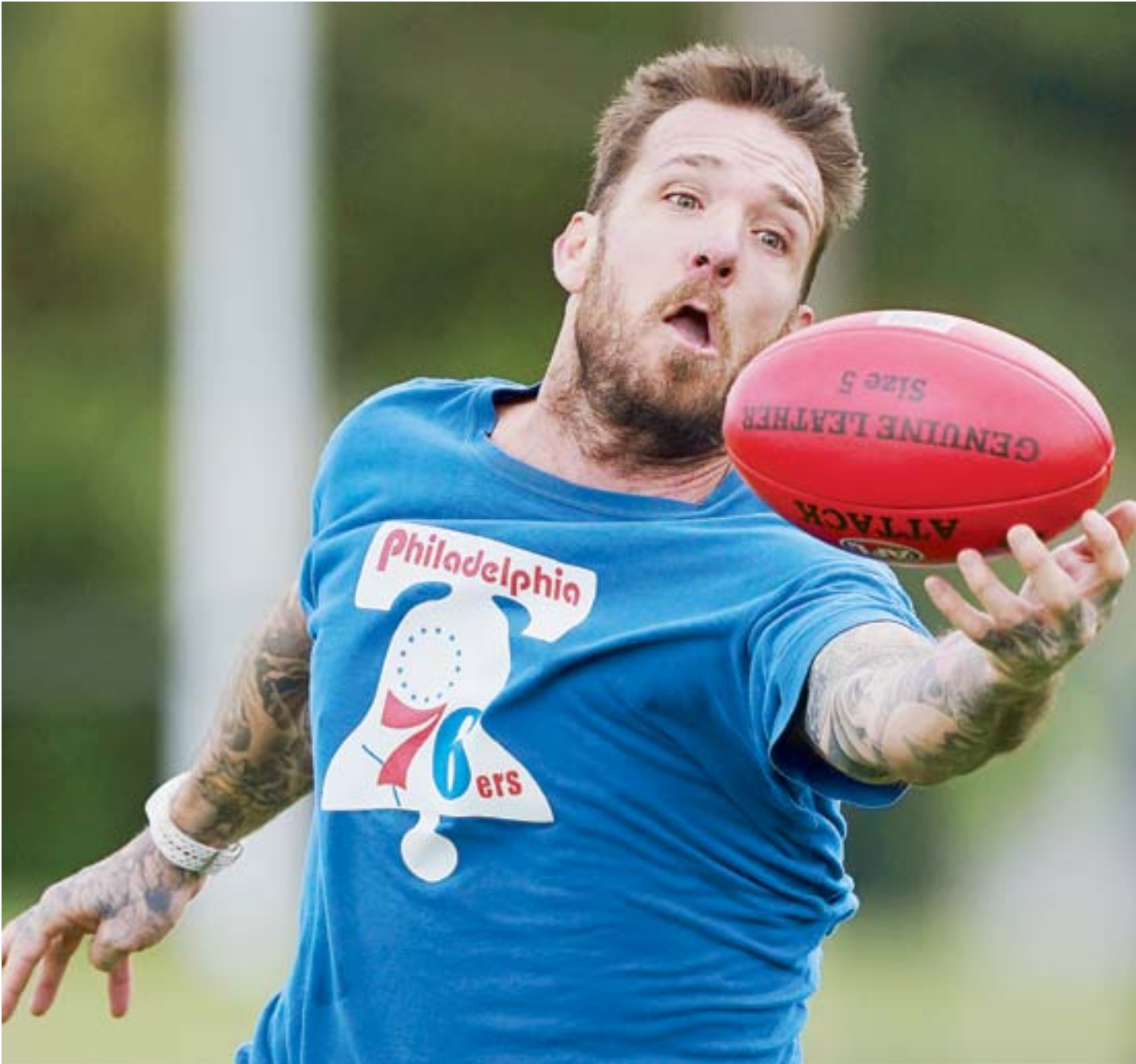
Dane Swan pictured during training in 2020.